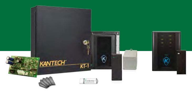
KT-1 Starter kit (SK-CE-1M-RDR above)