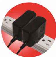
Fits Easily on Power Strips