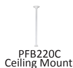
PFB220C Ceiling Mount